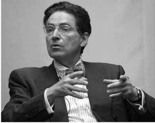
Dr. ALFRED de ZAYAS Professor of International Law Geneva School of Diplomacy, Switzerland

Dr. de Zayas kindly gave permission to include his book in the Conference publications