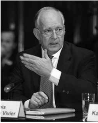
FRANÇOIS ROELANTS du VIVIER Belgian Honorary Senator